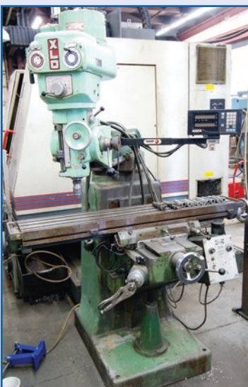
EXCELLO VERTICAL MILL