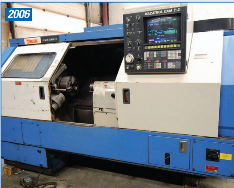
MAZAK QUICK TURN 25 QT25UNIV CNC LATHE