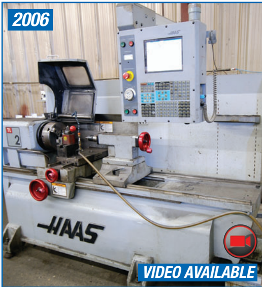
HAAS TL-2 CNC LATHE