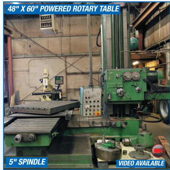
IVO LOLA (DARBERT) HORIZONTAL BORING MILL