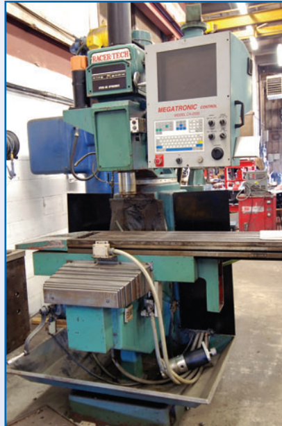
RACERTECH 4BVH CNC VERTICAL MILL