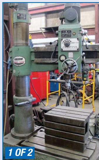
ARCHDALE RADIAL DRILL