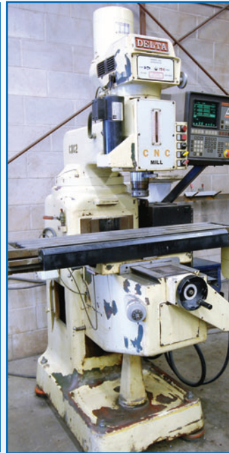
DELTA CNC VERTICAL MILL