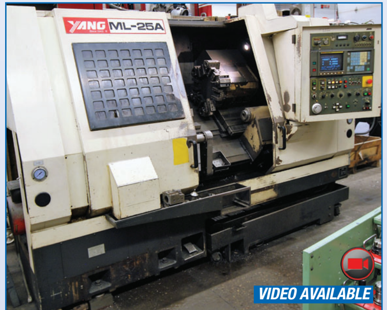
YANG ML-25A CNC LATHE