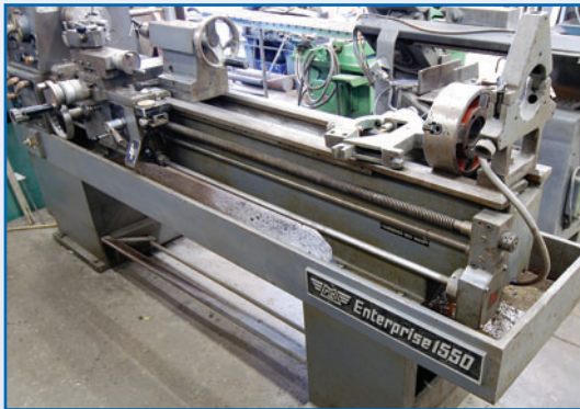
ENTERPRISE 1550 LATHE

PLUS: Power & Hand Tools, Toolboxes, CAT40/50 Tool Holders, Drill Bits, End Mills, Reamers, Workbenches, Servo Motors, Vises, Tool Holder Carts, Bar/Tube Metal Stock, Hardware, Racking, Precision Instruments and Much More!