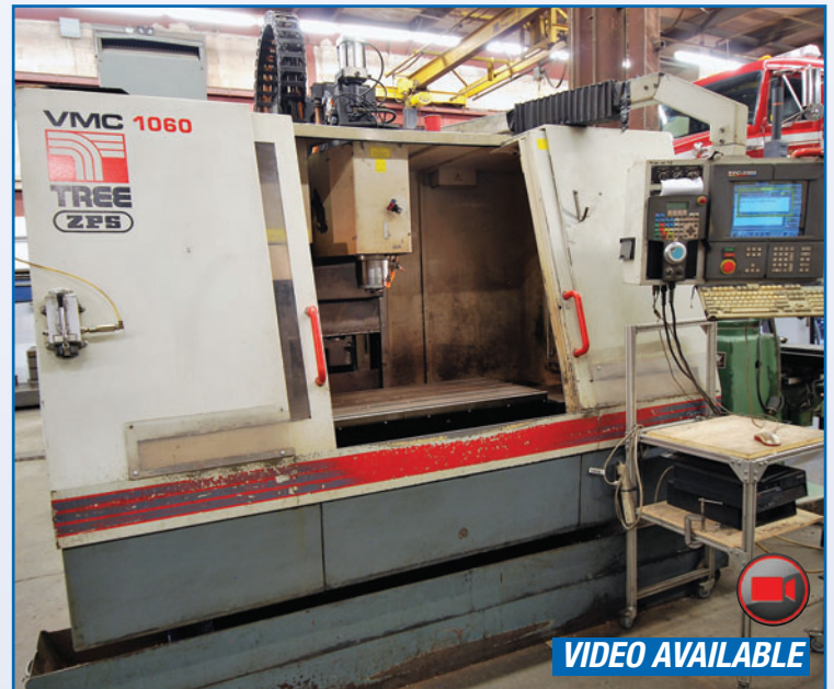
TREE VMC 1060/24 CNC VERTICAL MACHINING CENTER