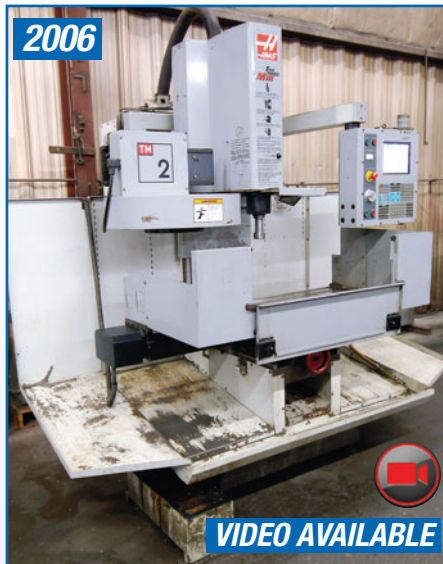
HAAS TM-2 CNC VERTICAL MACHINING CENTER