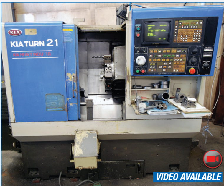
KIA KIA-TURN 21 CNC LATHE