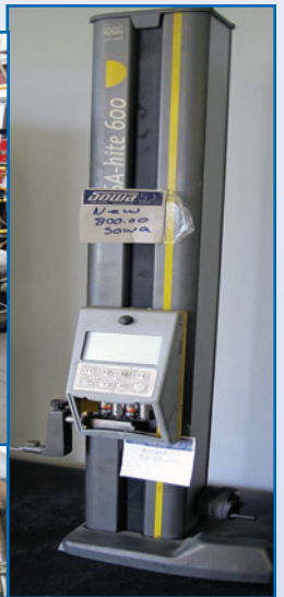
PARTIAL VIEW OF TOOLING