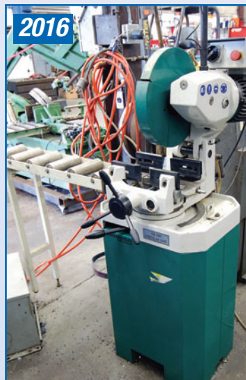
BERNARDO CS-350 CIRCULAR SAW