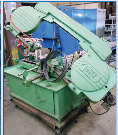
FORTE HORIZONTAL BANDSAW