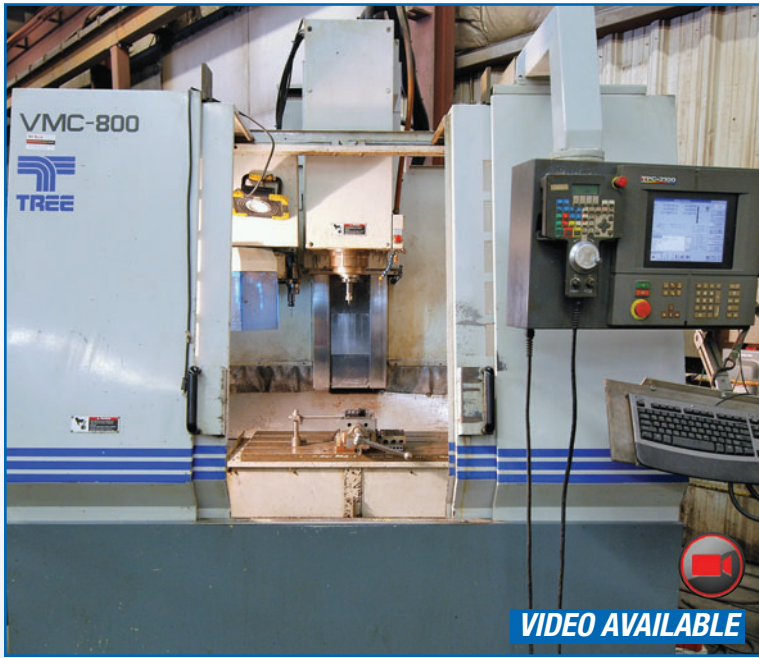
TREE VMC 800/20 CNC VERTICAL MACHINING CENTER