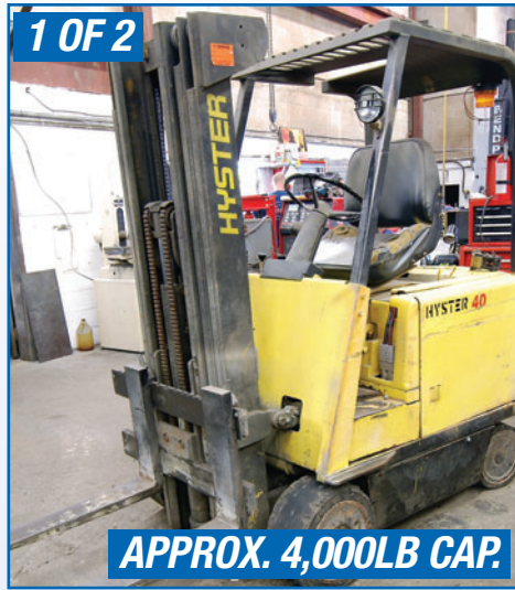
HYSTER ELECTRIC FORKLIFT