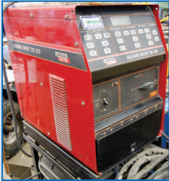
LINCOLN ELECTRIC SQUARE WAVE TIG255 WELDER