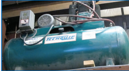
TECHQUIP AIR COMPRESSOR