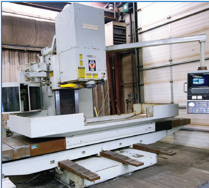
CINCINNATI MILACRON 20VC CNC VERTICAL MILL